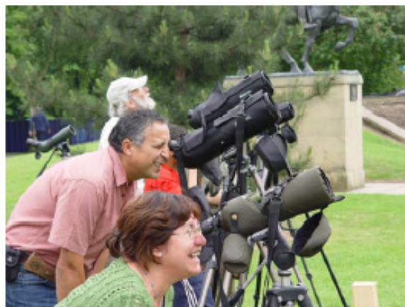
Bird watching in Derby.