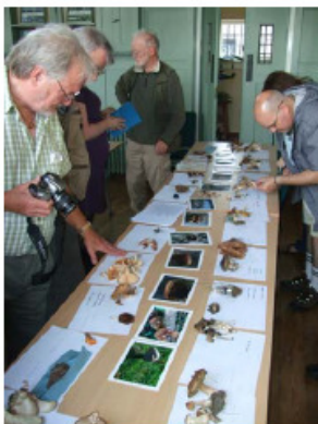
Fungal foray display.