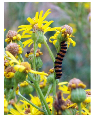
Cinnabar Moth caterpillar.

Conserving biodiversity includes restoring and enhancing species populations and habitats, as well as protecting them. Conservation of biodiversity is vital in our response to climate change, but also provides substantial economic, local and environmental benefits to communities, as well as vital life support services.